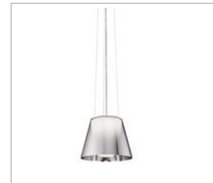
KTRIBE S2 design by Philippe Starck in 2005

Suspension lamp providing diffused light