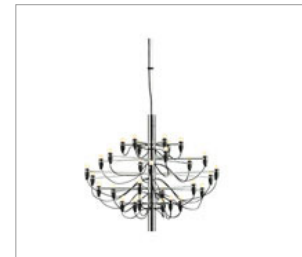
2097/50 design by Gino Sarfatti in 1958

Suspension lamp providing diffused light