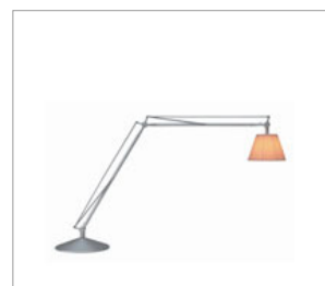
SUPERARCHIMOON design by Philippe Starck in 2000

Floor lamp providing direct and diffused light